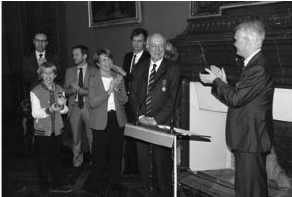
Phil Piot, center, receives the Legion of Honor from French President Sarkozy, right.