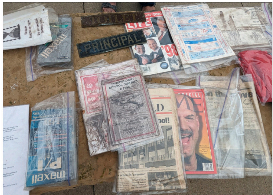
Black mold is seen inside the Zip-Loc bags used to enclose items that were included in the 1998 Luverne Elementary School time capsule.

Materials are still to be assembled, but a few decisions have