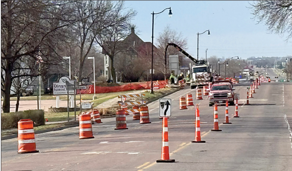
This photograph taken March 30 of Minnesota Department of Transportation doing preparation work on North Highway 75 ahead of the major reconstruction project.