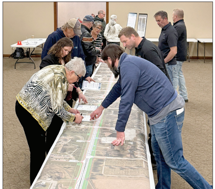
The Minnesota Department of Transportation hosted an open house Tuesday, March 24, at Generations to share updates about the Highway 75 reconstruction project.

Among the affected events are graduation events in May, Buffalo Days weekend during the first week of June, Hot Dog Night and