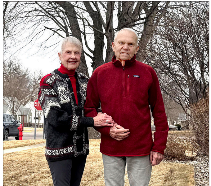
0305 highway 75 trees iversons

“We’ve lost a lot of trees over the years in storms — elms, box elders, ash, maples and ever-