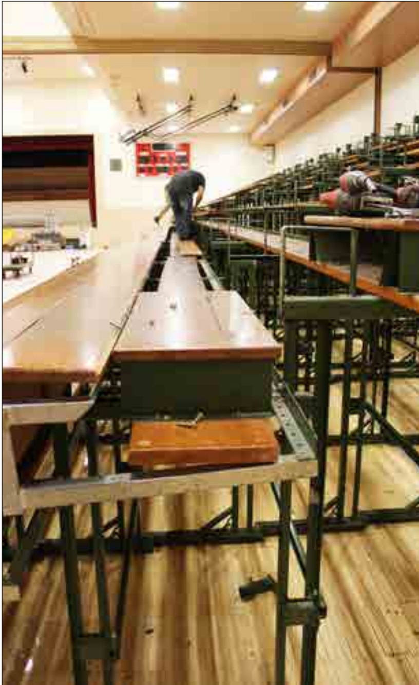
Bleacher Removal

Workers with Construction Specialties of Alexandria dismantle the wooden bleachers at Luverne High School gymnasium Monday afternoon, July 2.