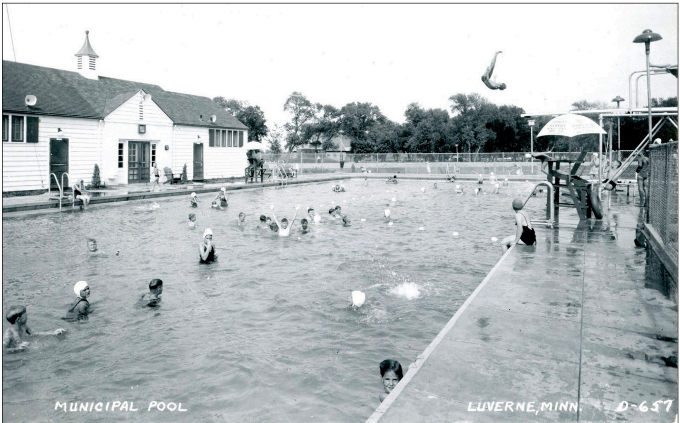
A 120-by-50-foot pool was 3 feet deep around the edges with a 9.5-foot diving pit in the center. The pool opened June 23, 1939, and the city appointed a board to oversee operations.