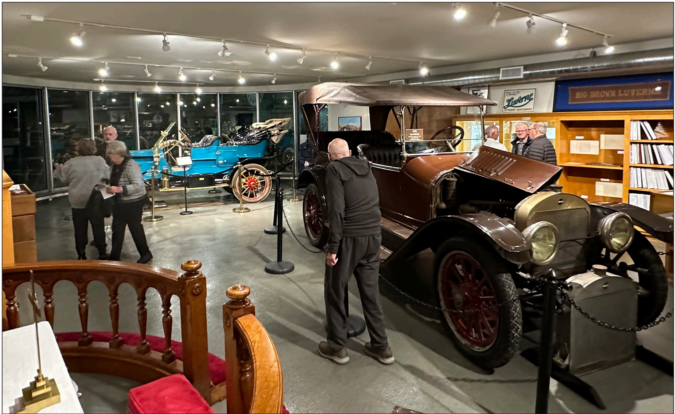
Visitors view the Luverne Automobiles on display in the History Center showroom on Nov. 18.